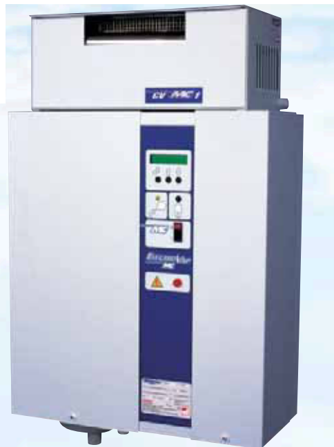
ELMC 5 with room ventilation unit