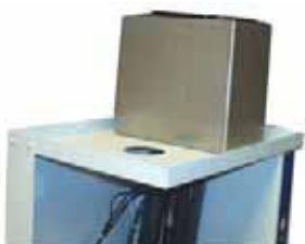
Filling cup platform