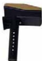
High level safety hygrometer