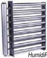
HumidiPack for short distance

* for capacities above 90 kg/h, please contact factory