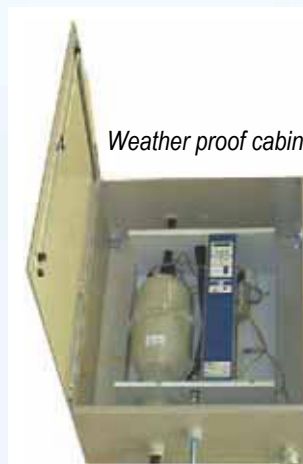
Weather proof cabinet