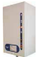
ElectroVap CMC Compact type humidifier