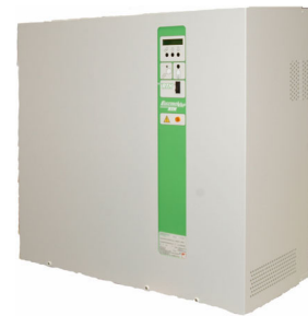
ElectroVap RTH with heating elements