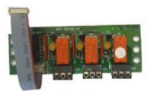
Optional remote information board