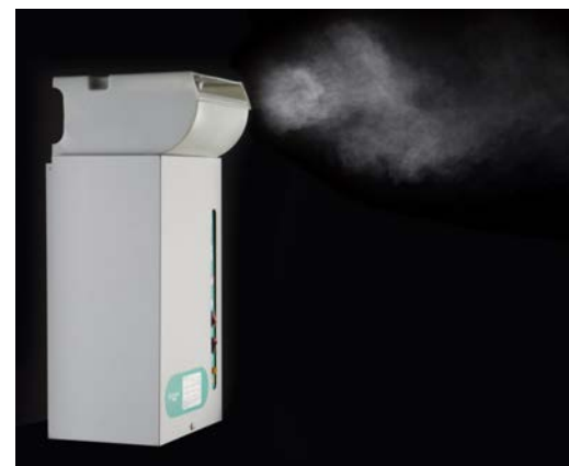
CMC humidifier with Blower Pack BP1 for room humidification

devatec reserves the right to change specifications or design of the equipment described herein without prior notice