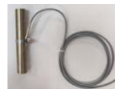
Anti-freeze device at 65°C