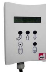
LCD display extension box